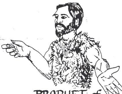
PROPHET of the HIGHEST