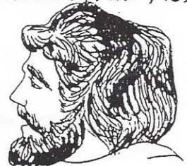
Shaphan, the Scribe