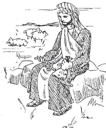
HIRELING (hired by the owner to care for the sheep)

FIND THE VERSE in John 10 and fill in the blanks.