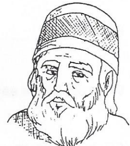
HILKIAH, the PRIEST