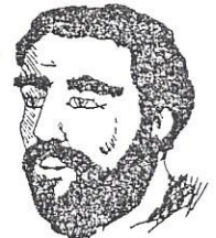
JOHN the BAPTIST