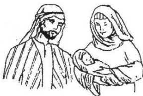
MARY, JOSEPH, BABY JESUS