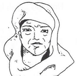
HULDAH, the PROPHETESS