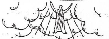
He was lifted into heaven