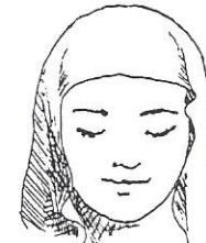
MOTHER of JESUS