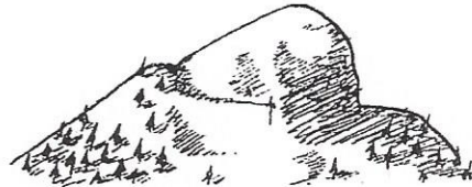
Into a Mountain