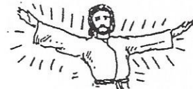
His clothes became white and glistening